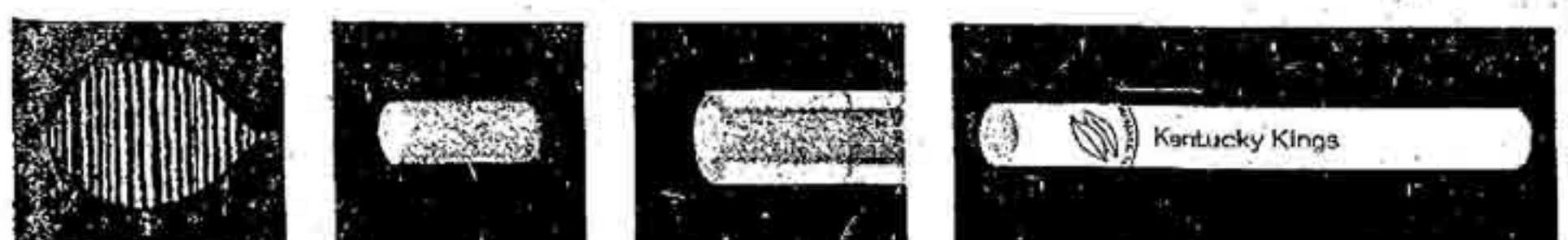
See how the all-tobacco filter is created from golden tobacco cut filter-fine. Filter-fine tobacco is made into the all-tobacco filter by patented filter machines. Kentucky Kings combines the all-tobacco filter with a luxury blend of tobaccos. Only new Kentucky Kings with the all-tobacco filter smooths the smoke naturally, yet never dulls the taste as artificial filters do. Kentucky Kings—the all-tobacco filter for that all-tobacco taste.