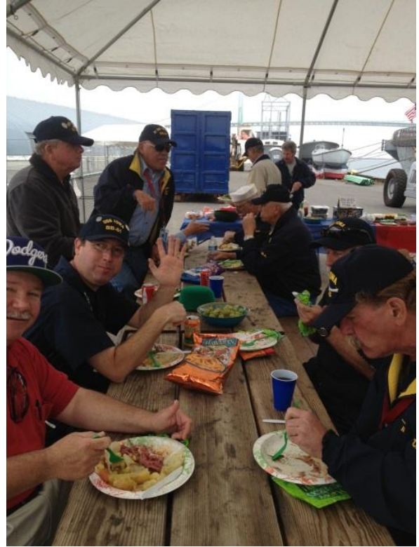
Crew Potluck on Friday, March 15th