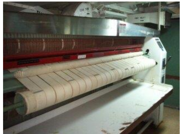
3rd Deck Tour - Sheet Press