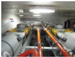
Starboard Ram Room. Rudder post cap shown in the center of the background. You could eat off this equipment but not the floors-very slippery with oil.

Next, we explored the Ships Laundry and Tailor Shop, located on the 3 rd deck below the CPO Mess and berthing compartments. The equipment in these spaces varies in age from original 1940s era, up to, and including, systems installed in the 1982 overhaul.