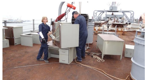
Desk Repair on the Forecastle