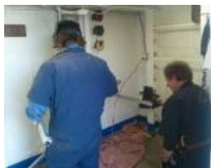
Installing table supports for the new Forward Quarterdeck.

Office, and boy did that little room need a lot of work. It used to house one of the dehumidification units that kept the ship in good condition while mothballed, so we had to remove the unit and weld many of the holes that were created for air to flow. When the room is completed, it will be the control center of Security's radios, paperwork, and the all-important coffee (I will be visiting the room often to check on the coffee). I would like to thank Mario Mares for leading the effort, and the rest of the crew for getting these areas completed.