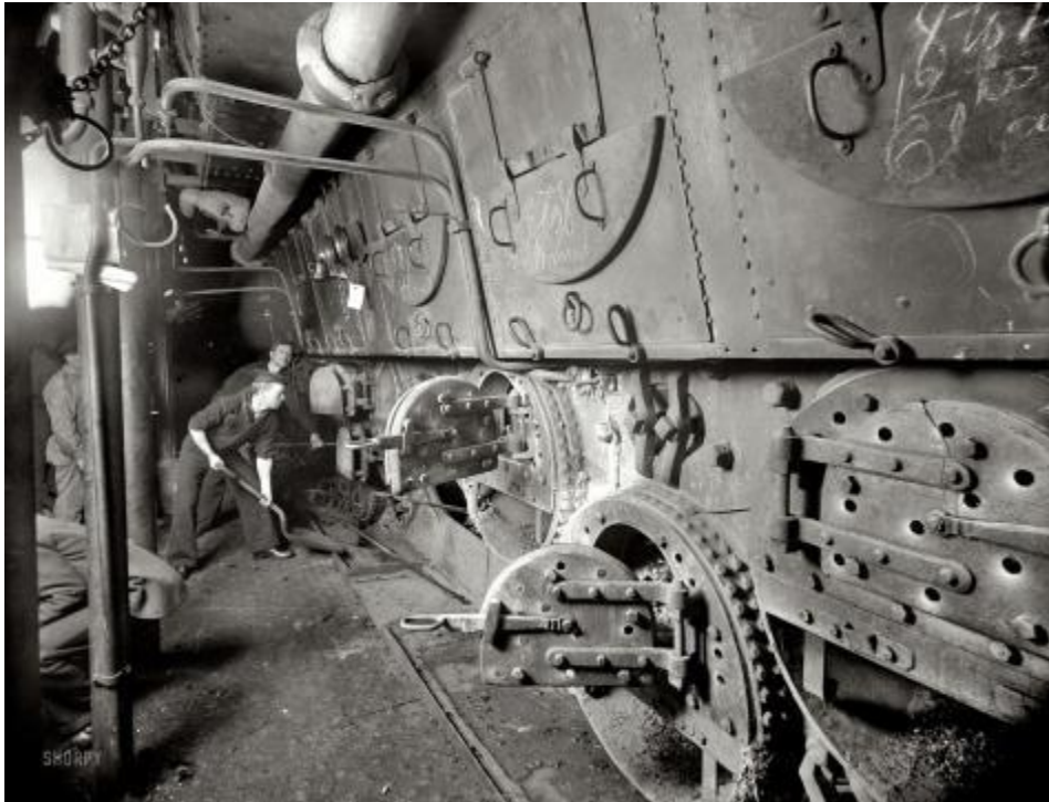
USS Massachusetts, fire room" Tending the battleship's coal-fired boilers. 1897