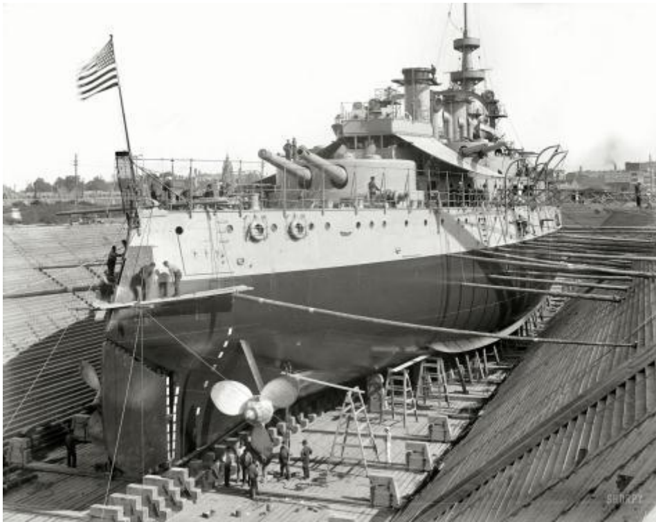
USS Oregon in dry dock, Brooklyn Navy Yard, 1898