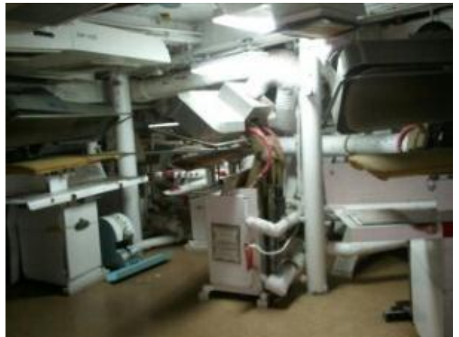
3rd Deck Tour - Laundry Equipment