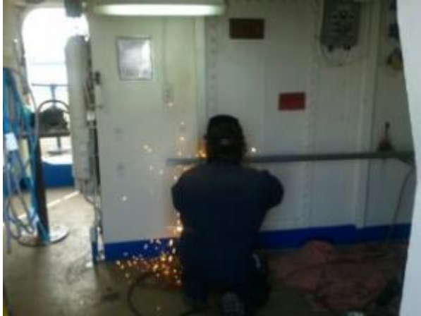
Welding table supports for the new Forward Quarterdeck