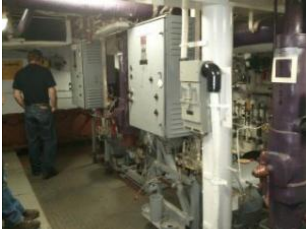
3rd Deck Tour - ICE Equipment Control Room