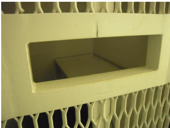
3rd Deck Tour - Solitary Lock Up