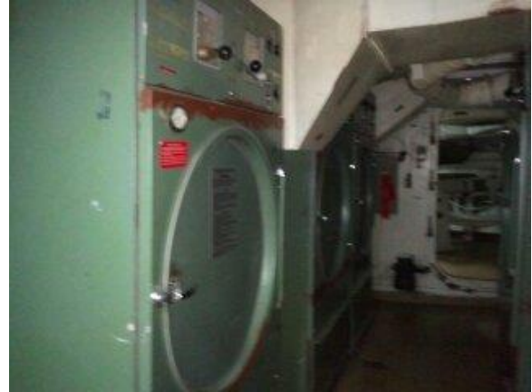
3rd Deck Tour - Laundry Equipment