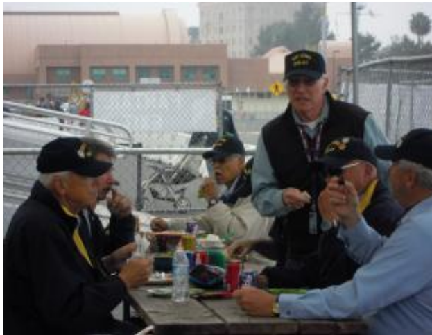
Crew Potluck on Friday, March 15