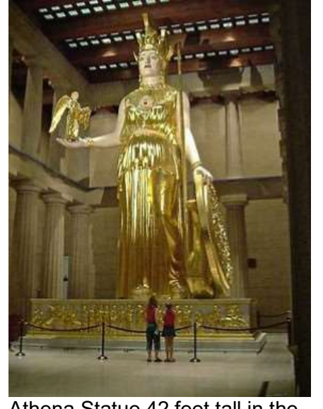
Athena Statue 42 feet tall in the Parthenon