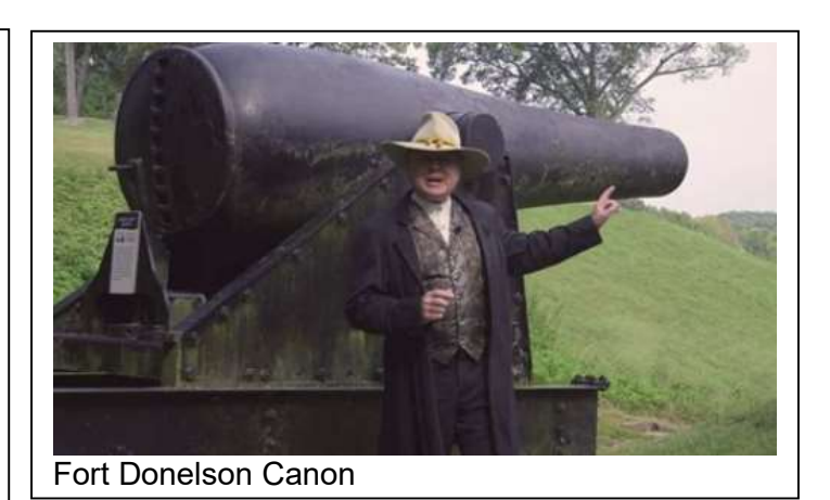
Fort Donelson Canons and the Cumberland River