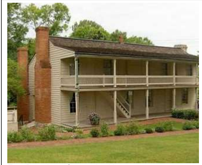
Fort Donelson Surrender House